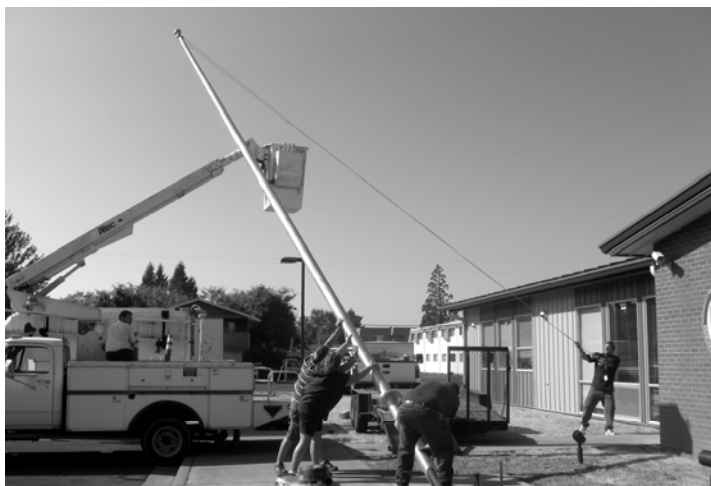
Above: AOS gets a new flagpole installed out front of the school building!