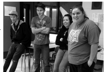
Above: Students on the first day of woods class!

gether to create the plans for the playhouse, which they chose to build like a castle.