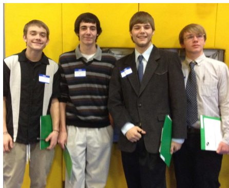
Students at the Senior Youth Job Fair

The first half of the year was filled with great accomplishments, as we had several students earn their high school diploma, others complete their GED, and many students reach closer to graduation by earning credits and passing their state required essential skills.